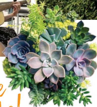
22 Succulent M Zen Garden