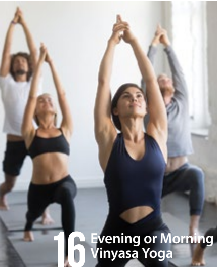
16 Evening or Morning Vinyasa Yoga