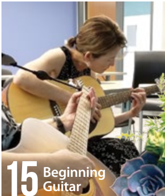
15 Beginning Guitar