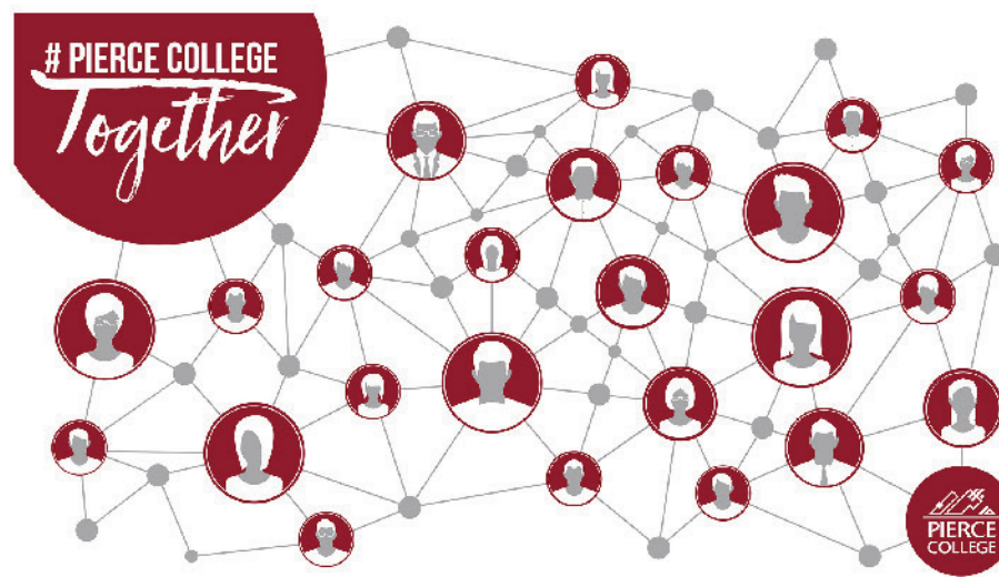
V-ERE Exclusive Zoom Backgrounds

From: Employee Recognition Event Sent: Friday, May 8, 2020 4:07 PM Subject: 6 of 10 – And now for the “5,280+ foot Social Distancing Requirement Award”